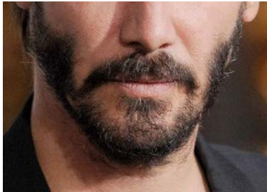
1. Keanu Reeves