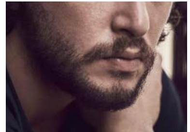
6. Kit Harington