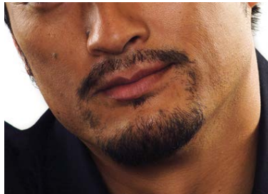
5. Ken Watanabe